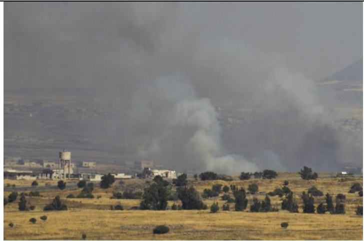
A picture taken from the Israeli Golan Heights shows smoke billowing from the Syrian side of the border on June 24, 2017.

The Hezbollah-affiliated al-Mayadeen TV station claimed two Syrian soldiers were killed in the strikes. Syrian officials confirmed “several” deaths, without giving details.