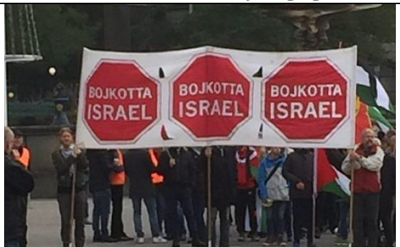
A pro-Palestinian, anti-Israel protest in Gothenburg, Sweden in 2015. The signs in Swedish read ‘Boycott Israel.’

At rallies across Europe, participants chant about shooting Jews, an ancient massacre of Jews and freedom for Palestinian terrorists