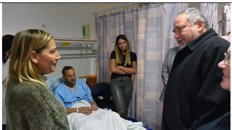
Minister Lieberman visits wounded soldiers

Yoav Zitun and Matan Tzuri|Published: 02.20.18, 20:12