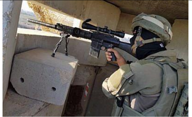
A Border Police sniper takes aim across the Gaza border toward demonstrations along the security fence, on December 9, 2017.

Hundreds of Palestinians took part in violent protests across the West Bank on Saturday, the Israeli military said, in a substantial decrease from the thousands that rioted the day before over the decision last week by US President Donald Trump to recognize Jerusalem as Israel's capital.