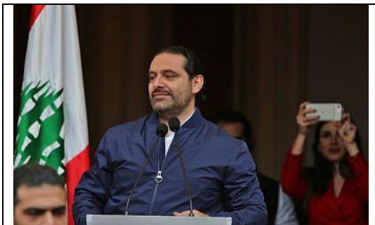
Lebanese Prime Minister Saad Hariri greets supporters upon arriving at his home in Beirut on November 22, 2017.

Al-Khazali was later seen standing next to a wall on the border near the Fatima Gate in the Lebanese border village of Kfar Kila.