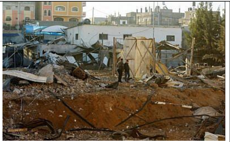
Palestinians survey the damage at a military facility belonging to the Hamas terror group in Beit Lahia in the northern Gaza Strip early on December 9, 2017, following an Israeli air strike in response to Gazan rocket fire.

Six Palestinians were arrested in the West Bank, and six were lightly wounded in the clashes, the IDF added.