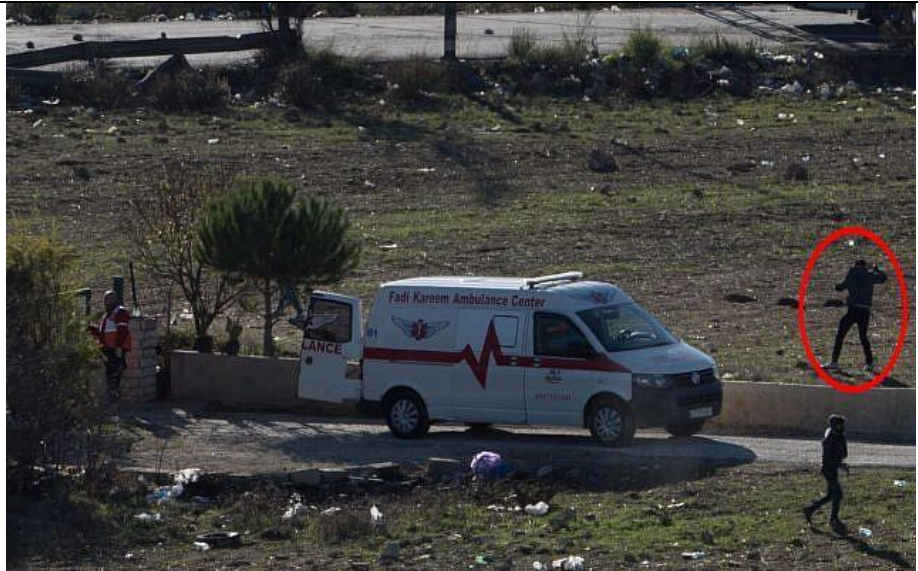
A Palestinian rock thrower apparently uses an ambulance as a shield during a violent demonstration in Ramallah on December 9, 2017.

The Israel Defense Forces accused Palestinian protesters of using an ambulance as a human shield during a violent demonstration in Ramallah on Saturday.