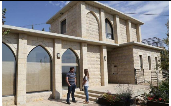
One of the homes set to be demolished in the Netiv Ha'avot outpost in Gush Etzion, September 2, 2016. [Does this look like a 'settlement home? NO WAY – rdb]

While they agreed to refrain from inviting demonstrators into their homes to obstruct the approaching demolition, hundreds of youth are still expected to descend on Netiv Ha'avot on the day of the evacuation.