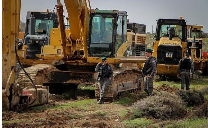
Border Police officers guard near tractors during preparations for the evacuation and demolition of the illegal Netiv Ha'avot outpost on February 7, 2018.

The state urged the High Court of Justice to delay its sanctioned demolition of the illegal Netiv Ha'avot outpost in the West Bank by three months, in a petition submitted Tuesday on behalf of the residents.