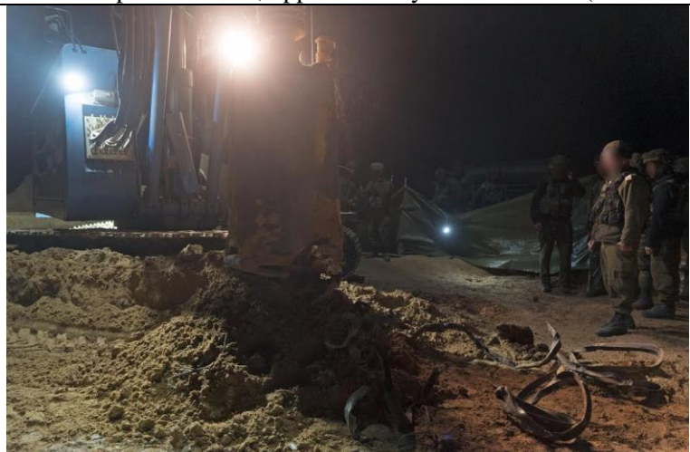
Israeli troops prepare to destroy a Hamas attack tunnel that entered Israeli territory, on December 9, 2017.

IDF spokesperson Lt. Col. Jonathan Conricus would not specify where exactly it was located in Israel, but said it ended in open farmland, approximately one kilometer (0.6 miles) from the nearest Israeli community.