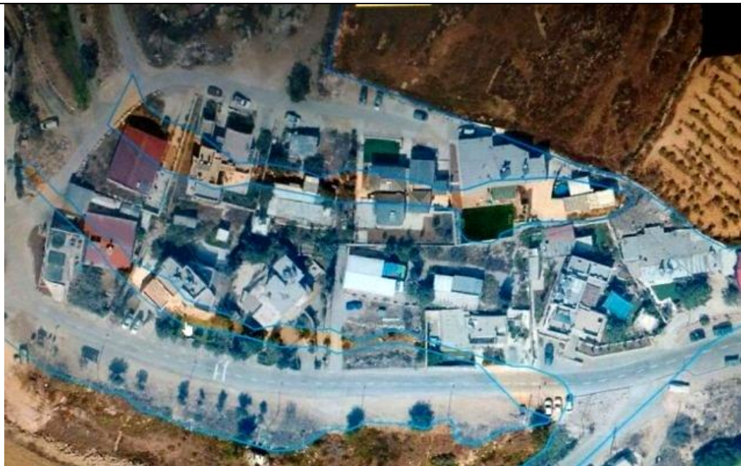
An aerial photograph of the Netiv Ha'avot outpost. The areas colored in blue were deemed by the High Court to be state land. The 17 structures that stand on the non-shaded areas have been sanctioned for demolition.

If adopted, the plan would see the “problematic parts” of those seven homes sawed off, while the rest of the structure would be allowed to remain standing. This would mean that only eight homes would require complete demolition by security forces.