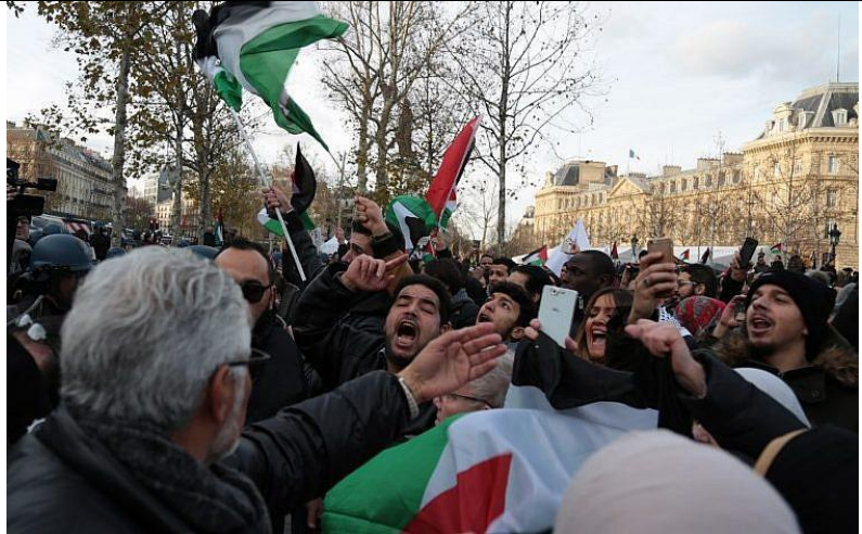
Demonstrators shout slogans as they wave placards and flags while taking part in a pro-Palestinian protest in Paris on December 9, 2017, against US President Donald Trump’s recognition of Jerusalem as Israel’s capital.

“I am not prepared to accept this hypocrisy, and as usual at this important forum, I will present Israel’s truth without fear and with head held high,” he added. Netanyahu will be meet in Brussels with European Union leaders on Monday.