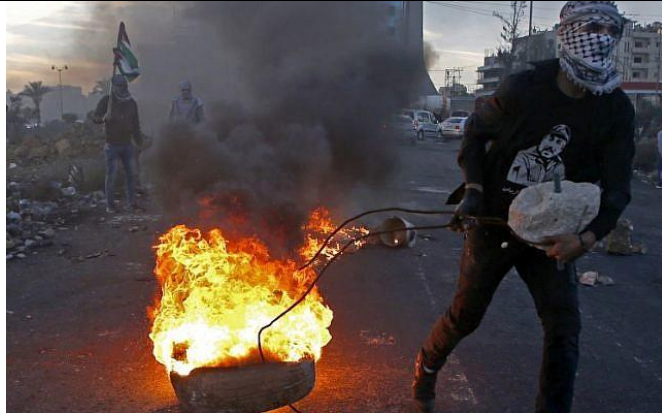
A Palestinian protester pulls a burning tire during clashes with Israeli security forces near an Israeli checkpoint in the West Bank city of Ramallah on December 9, 2017, following the US president's recognition of Jerusalem as Israel's capital.

By Judah Ari Gross and TOI staff 9 December 2017, 8:12 pm