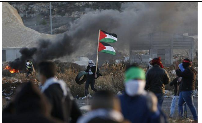
Palestinian protesters clash with Israeli security forces near the West Bank city of Ramallah on December 9, 2017.