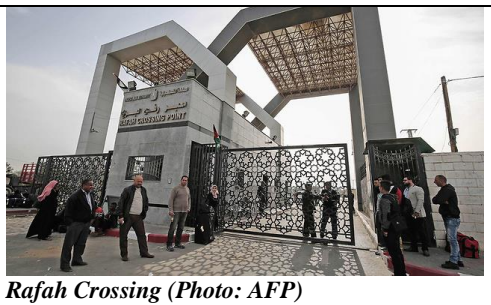
Rafah Crossing

Egypt to open Rafah border crossing with Gaza Strip for 4 days to ease humanitarian crisis, allow patients to seek medical assistance, and students, foreigners to leave the enclave.